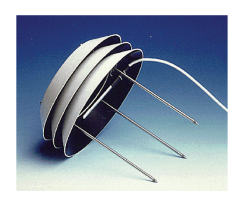
DTR15 Ground Radiation Shield

DTR15 is designed to reflect direct solar radiation by means of its highly reflective white surface. It is used to protect the DTS12G Ground/Soil Temperature Probe from solar radiation and rain. The shield is fastened to its location by inserting its 3 stainless steel spikes into the ground.